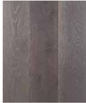
Alaskan Grey Oak