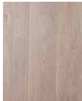
Mink Grey Oak