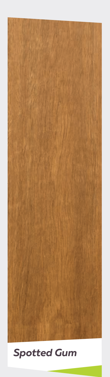
1860 x 136 x 14mm UV Lacquer | Satin Finish | T & G | 0.6mm top