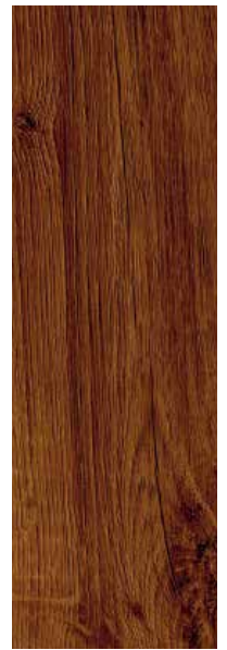
Benin Oak 24572