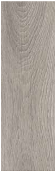
Ardon Oak 24933