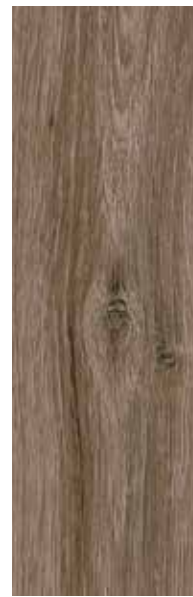
Huxley Oak 24867