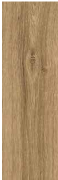
Fogo Oak 24244