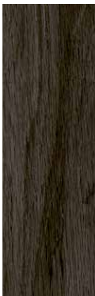
Opazo Oak 24983