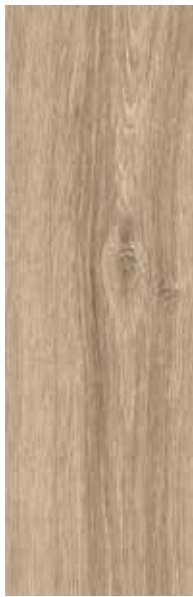
Avri Oak 24219