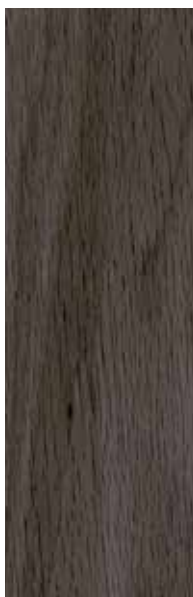
Zain Oak 24890